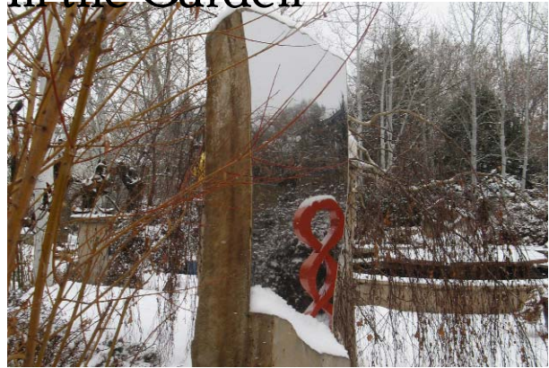
The National Sculptors' Guild Garden has been exceptionally beautiful this snow laden winter. Mark Lechliter's Split Infinitive , 56" x 16" x 12" is mirrored in the Haskew/Kinkade Reflection Series #1 , 79" x 32" x 14".