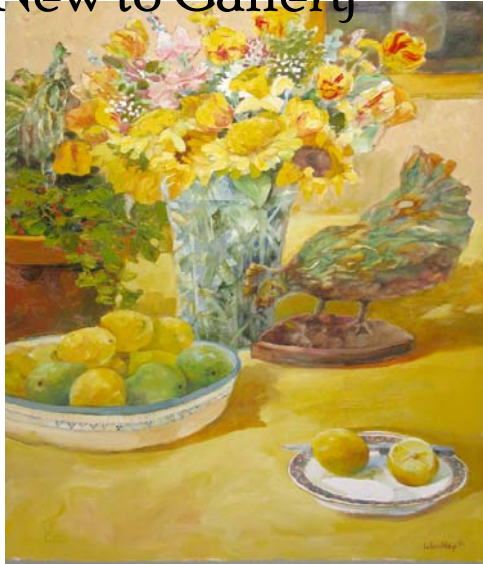
Yellow , 30" h x 22" w $2,000. watercolor & oil on paper by Ellie Weakley

Walk on Water 44" h 138" w 22" d - Resin $40,000 by Clay Enoch, NSG Associate has just been installed in the NSG Garden. also available in bronze