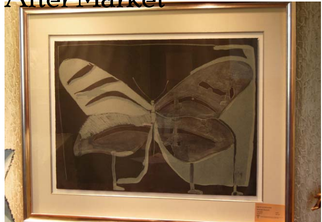
Available on the Secondary Market is a beautiful Fritz Scholder lithograph, Night Butterfly #15/50 40"H x 48"W with frame, circa 1979 $6,000 (OBO) See Fritz Scholder at the Denver Art Museum thru 6/13